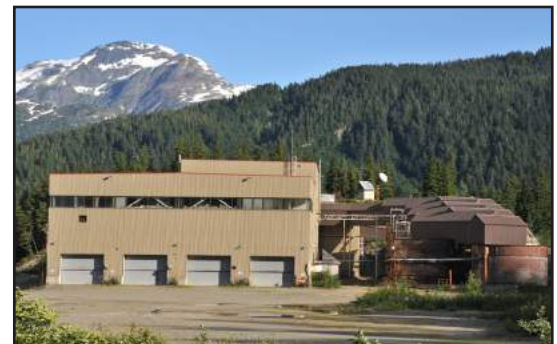
Mill at the Premier property