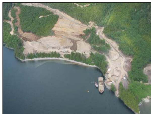
Swamp Point Aggregate Project